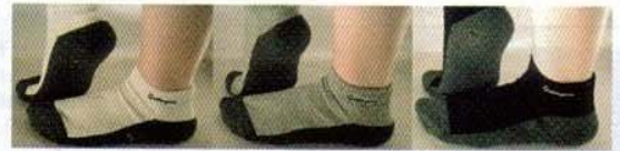
Short Socks 051

Greenyarn has a selection of short socks (051). All Greenyarn short socks 051 feature fine gauge 200 needle count, cushioned sole support, Eco-fabric. They come in 3 different colors.